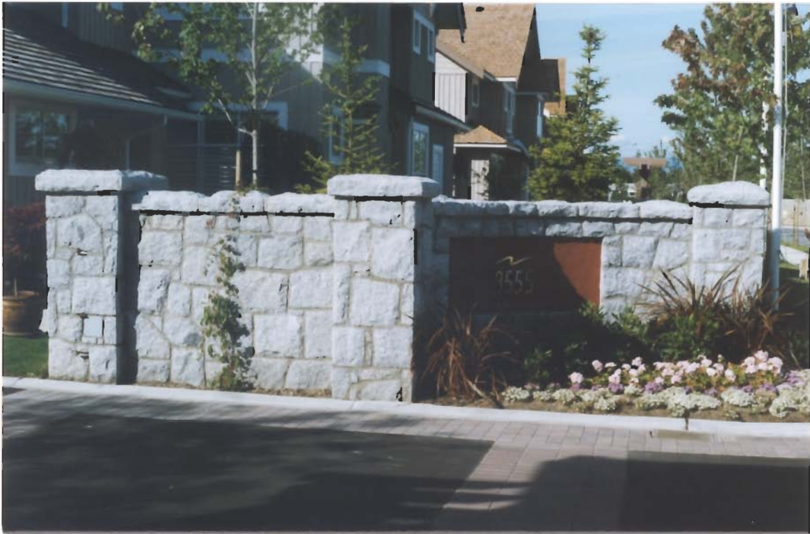
Styled north feature wall at Richmond townhouse complex.