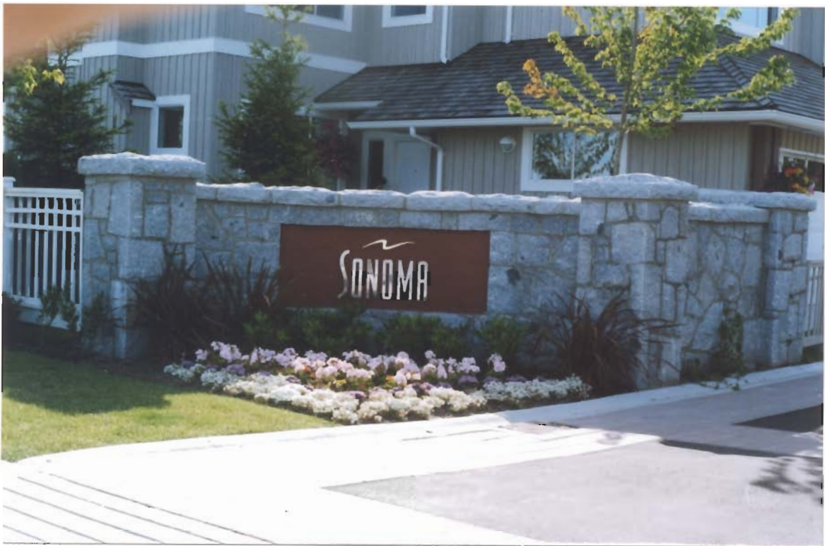
Styled south feature wall at Richmond townhouse complex.