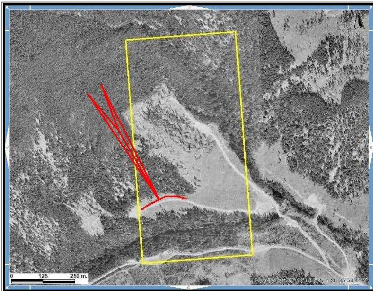
Scale 1: 6,000 Map 092H Excerpt Tenure Coordinate Reference Longitude 120° 35' 53.1" W – Latitude 49° 16' 14.5" N