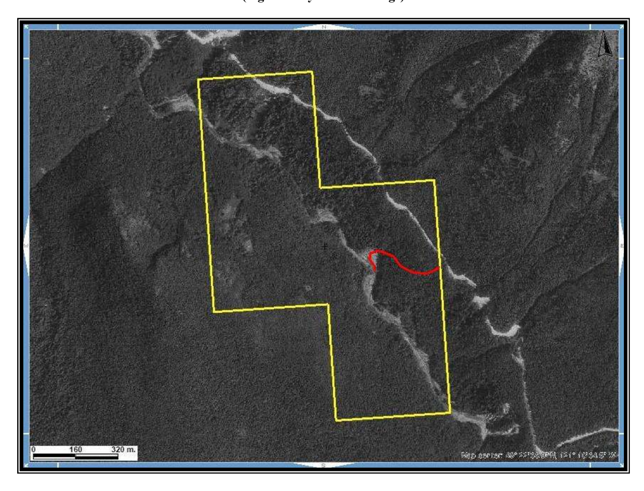
Scale 1: 8,000 Map 092H Excerpt Tenure Coordinate Reference 121° 10' 34.5" W Longitude – 49° 22' 36.9" N Latitude