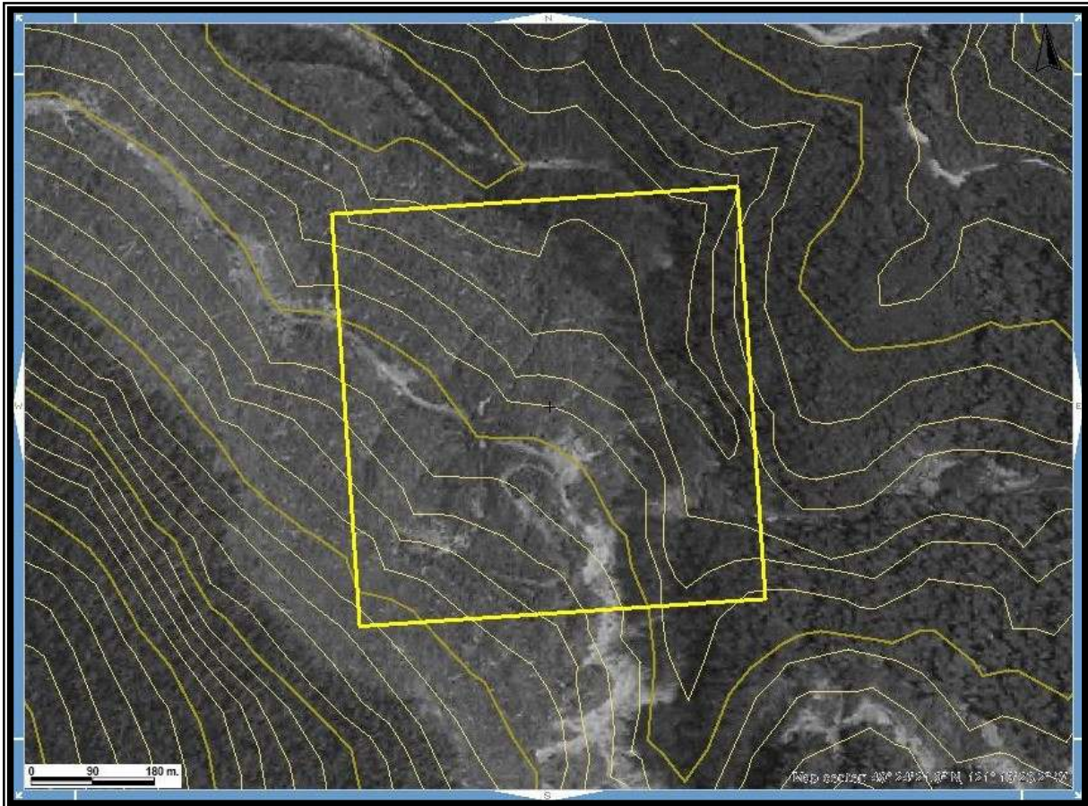
Scale 1: 4,000 Map 092H Excerpt Tenure Coordinate Reference 121° 13' 23.2" W Longitude – 49° 24' 21.9" N Latitude