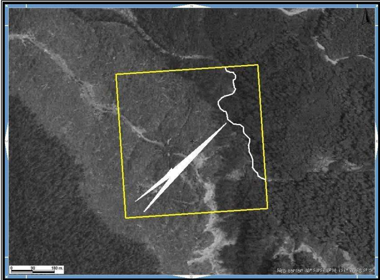
Scale 1:4,000 Map 092H Excerpt Tenure Coordinate Reference 121° 13' 23.2\"