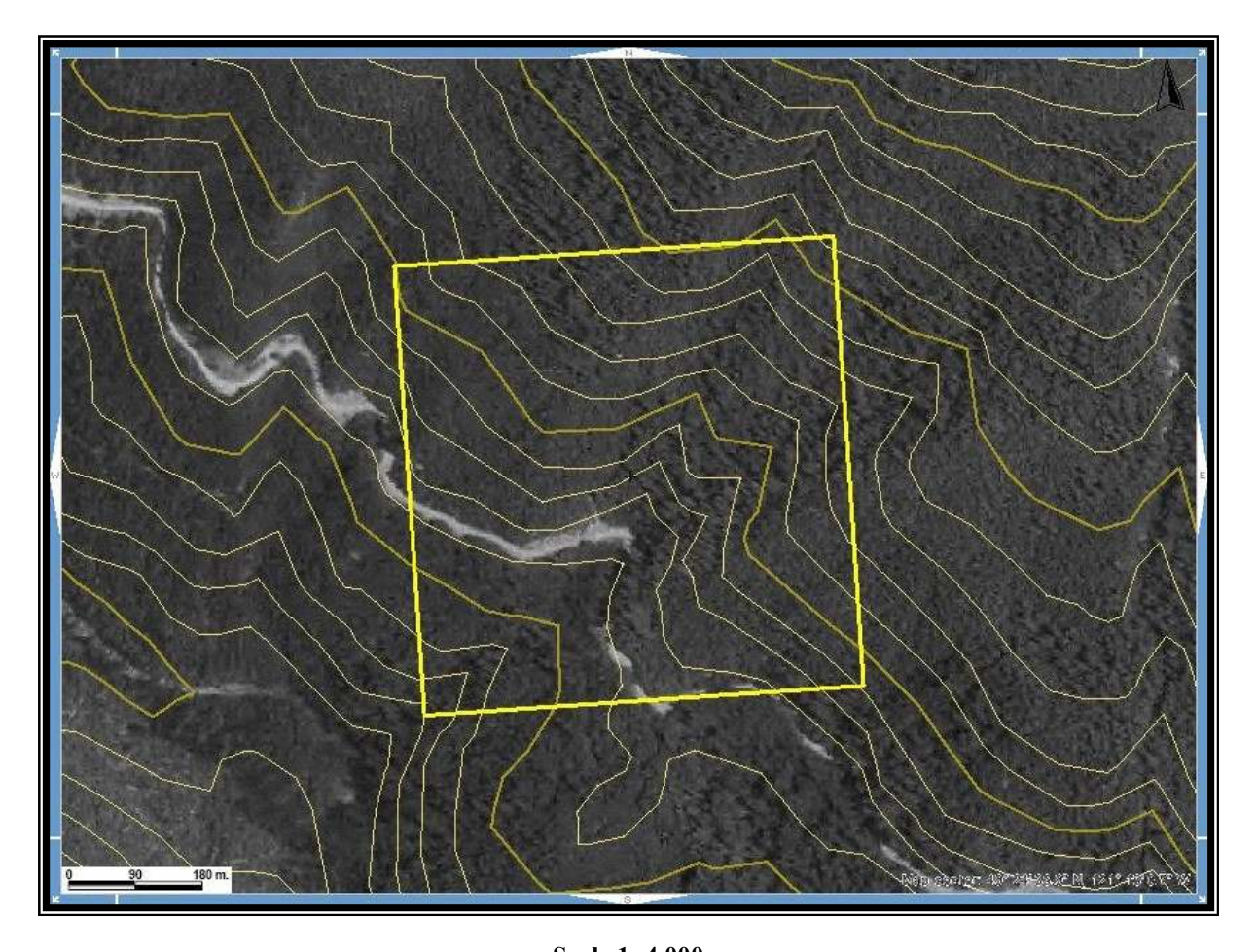
MAP 3 Contour Map of Claim Area

Scale 1: 4,000 Map 092H Excerpt Tenure Coordinate Reference 121° 13' 00.7" W Longitude – 49° 24' 36.9" N Latitude