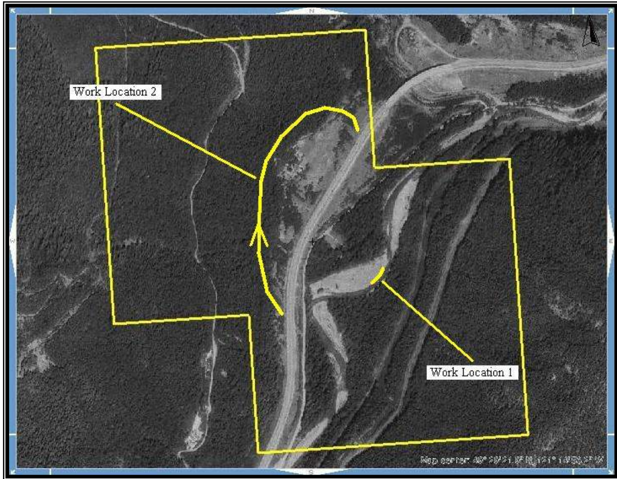
Scale 1:8,000 Map 092H Excerpt Tenure Coordinate Reference Long. 121° 14' 53" W – Lat. 49° 29' 22" N