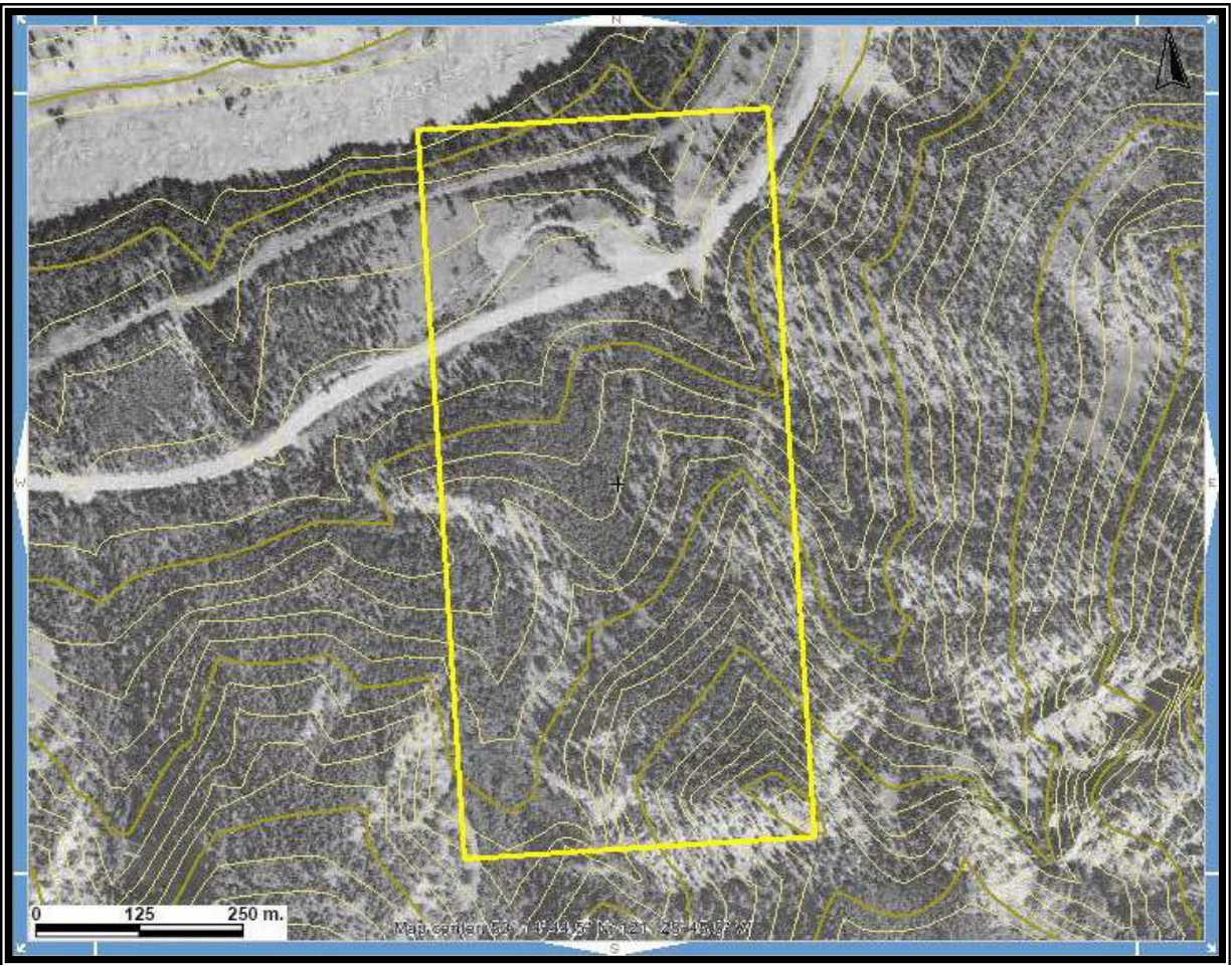
Scale 1: 6,000 Map 092I Excerpt Tenure Coordinate Reference Long. 121° 28' 45.8" W – Lat. 50° 14' 44.5" N