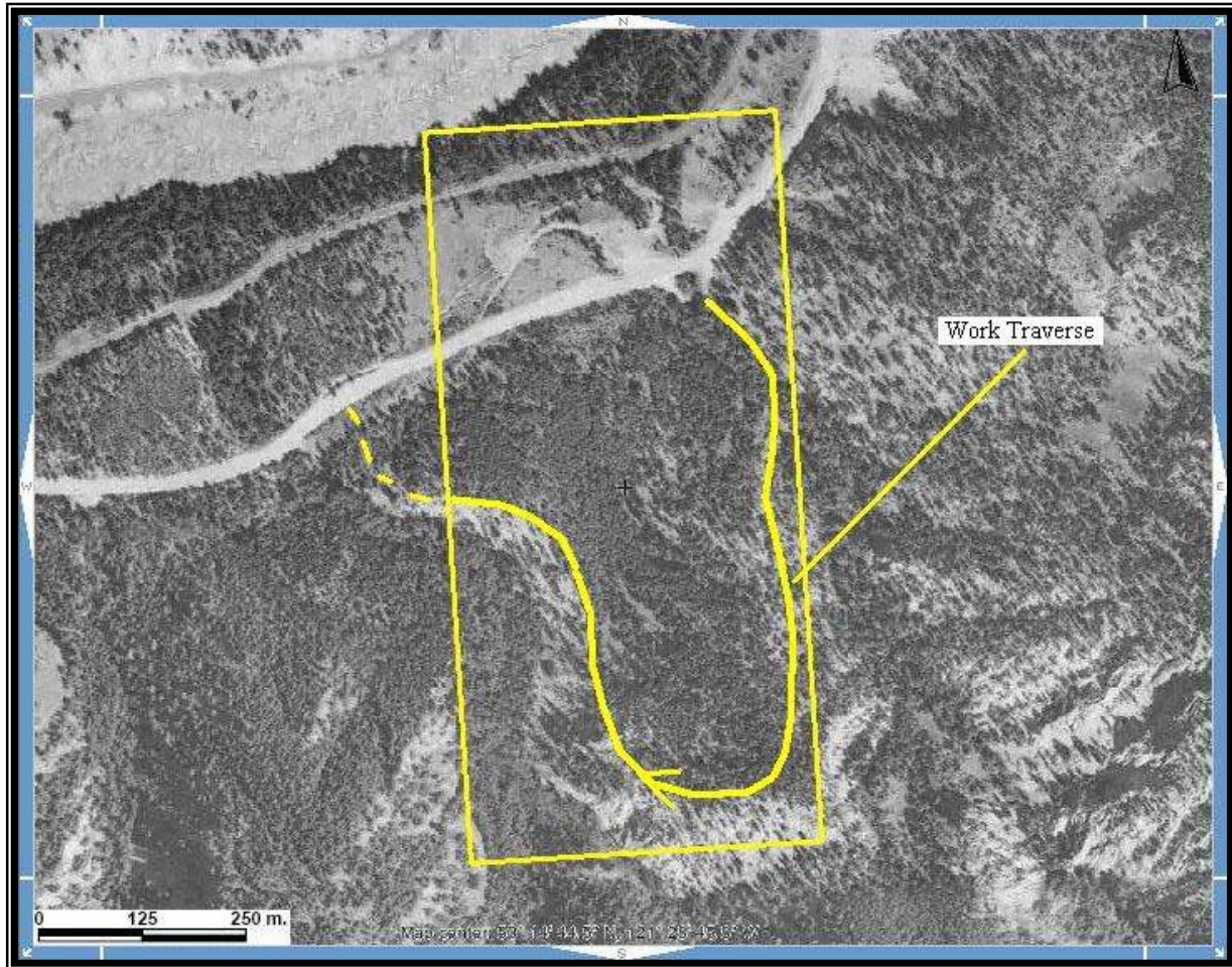
Scale 1: 6,000 Map 0921 Excerpt Tenure Coordinate Reference Long. 121° 28' 45.8\"