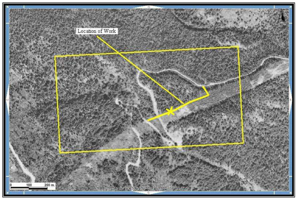
Scale 1:5,000 Map 092J Excerpt Tenure Coordinate Reference Long. 122° 13' 34.9" W – Lat. 50° 45' 22.0" N