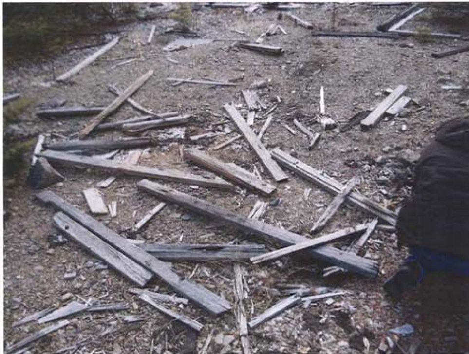
The remains of the core shack at Aberdeen Mine.