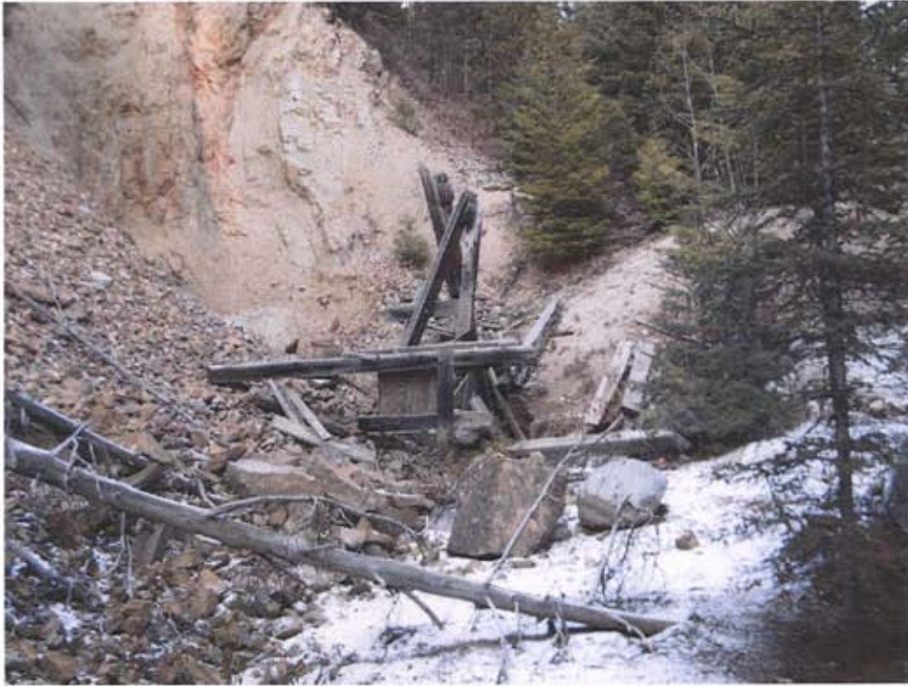
tThe remains of the Historic Aberdeen Mine.