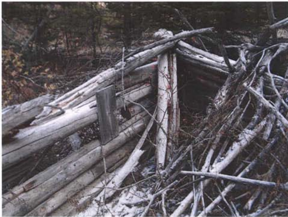
The original Mine Cabin.