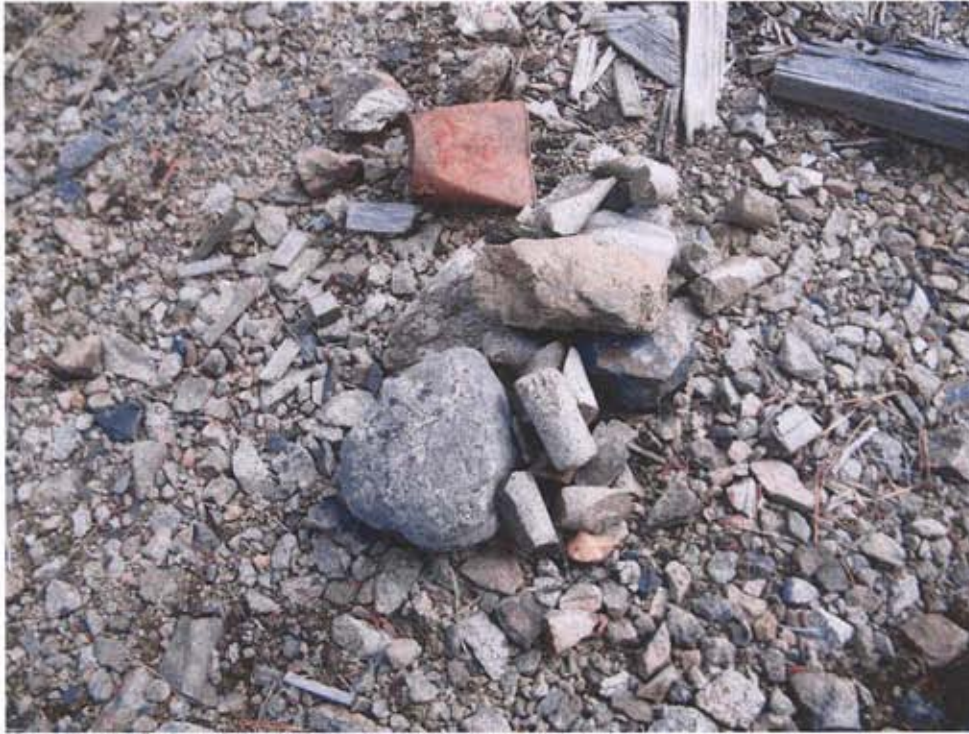
Old Core Samples strewn about at the Aberdeen Mine.