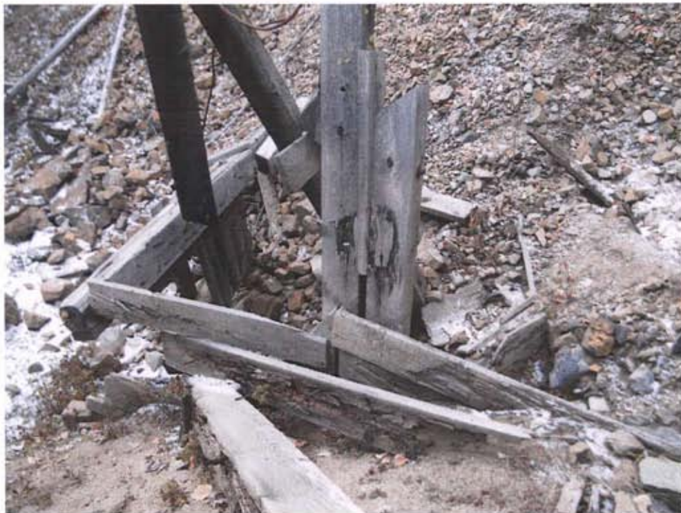
Looking down on the mineshaft.