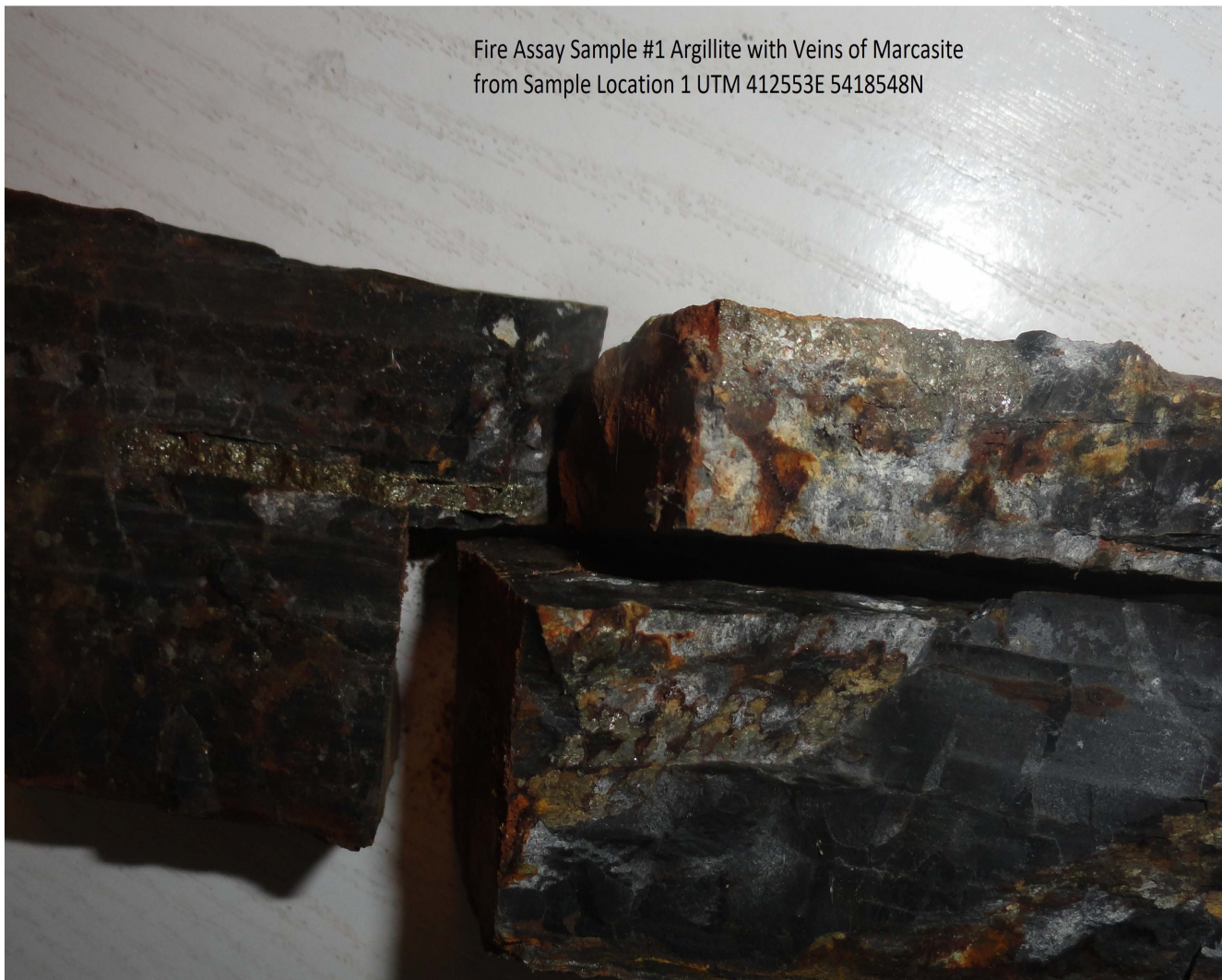
Fire Assay Sample #1 Argillite with Veins of Marcasite from Sample Location 1 UTM 412553E 5418548N